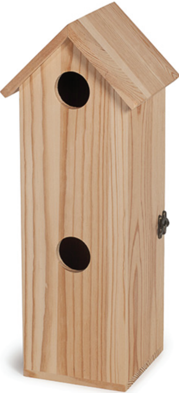
Rackpack tweet suite laser engraving